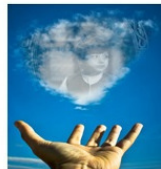
He praises her to the skies