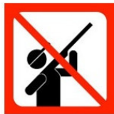
It puts a damper on hunting