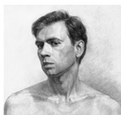
He has a head on his shoulders