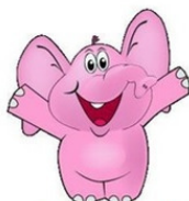
I am thrilled to bits