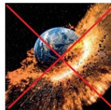
It's not the end of the world