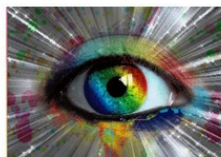
I have stars in my eyes