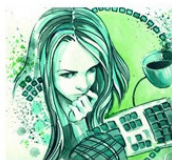
I am bored stiff/ It's a frightful bore

Guess Russian equivalents of the idioms by the pictures given