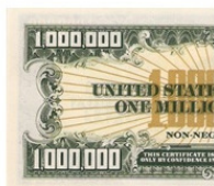
It's one in a million/ thousand

Guess Russian equivalents of the idioms by the pictures given