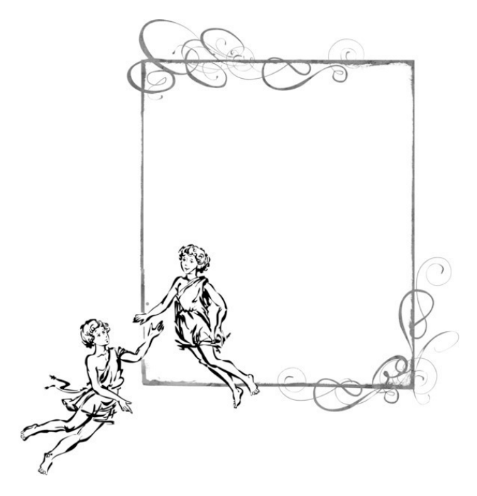
The place for your photo