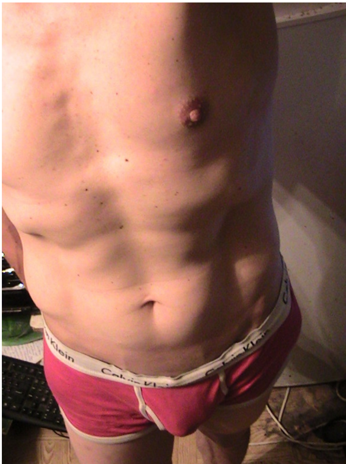
25.07.2016. Not bad: for almost 38 years!

immersion blender and carefully grind, mix with a spoon until uniform consistency. The soup-delicious! don't forget to season with pepper, salt if needed..