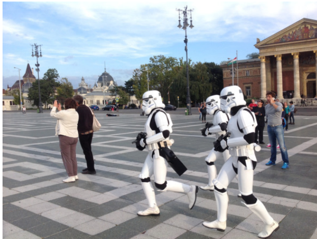
Budapest-Bratislava Two cities in one Weekend

Created with Ridero smart publishing system