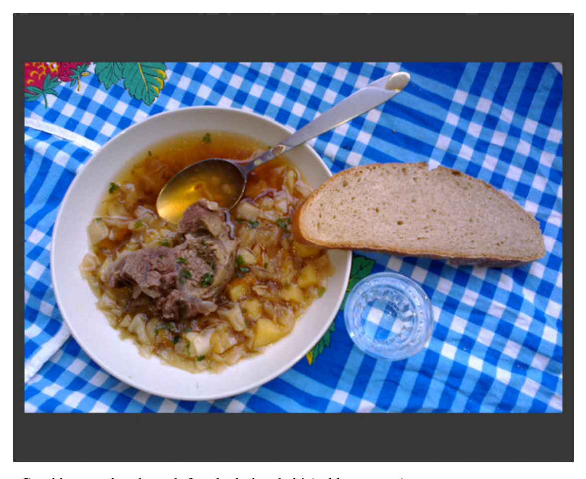
Good hot meal and snack for alcohol – shchi (cabbage soup)

Owing their cultural traditions and historically Russians used to consume alcohol. In some period It's often were vodka or meads and now it's one of the most popular Russian drinks for different reasons and occasions.